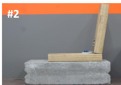
Samples as supplied